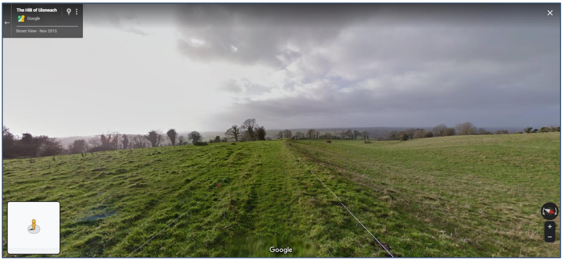
Figure 1-2 Google Street View Image showing a view towards the Wind Farm Site from the Hill of Uisneach @Copyright Google.

It is highly likely that the constituent elements and composition of the landscape view visible from the Hill of Uisneach will be of a very similar nature to the open views over rolling vegetated farmland as presented in VP13, therefore descriptions of the baseline landscape were also influenced by the photographic imagery of the 'Existing View' presented for this viewpoint. In the context of the photomontage booklet (views presented at 90° and 53.5°), the Rendered Wireline enables a visual impact assessment to be conducted that addresses the scale, form and arrangement of the proposed turbines within views from the hill. The scaling and modelling of turbines in the Rendered Wireline is consistent with all other photomontages, ultimately enabling a robust visual impact assessment.